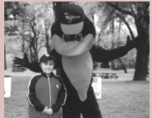
Oriole Bird & young friend.