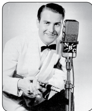
Artie Shaw in his heyday.