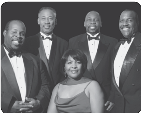
The Platters will perform at the Nov. 22 Gift of Life Gala.

Saturday, Nov. 22, 6:30-11 p.m. Hyatt Regency Baltimore